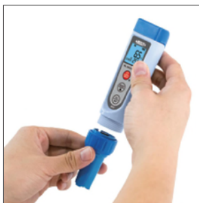
electrodes can be replaced